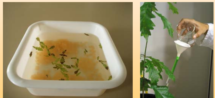
Figure 4: Inoculation methods

The inoculation tests were conducted on 50 two-year Q. petraea plants of two different provenances of Saxony (Germany), representing different climate conditions. All plants were grown from seeds in green houses in sterilized peat-sand-mixed soil. Half of the plants were influenced by adding ammonium nitrate (2,5 g/m 2 ) and half by growing under drought. Soil infestation was performed in May 2007 by using P. quercina which was isolated from a mature declining oak stand in Eastern Germany. Altogether twenty plates were flooded for two days with a sterilized soil suspension after incubating the cultures on carrot agar for one week. For stimulating sporangial production juvenile oak leaves were used. The inoculum (zoospores and mycel) were added directly sideways into each plant pot with drainage holes (Fig. 4). The non-inoculated control plants of each experimental set were treated with sterilized water only.