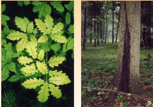
Figure 1: Symptoms of oaks infected by Phytophthora spp. Left: five years old plant with yellowish and small-sized foliage, right: basal stem necrosis