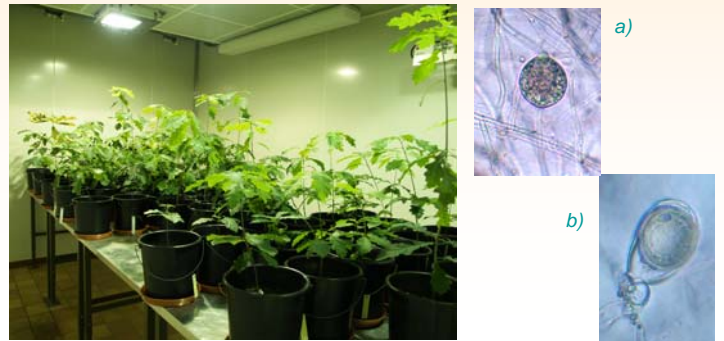
Figure 2: Two years old Sessile oaks of East and Western Saxony provenances inoculated with P. quercina in climate chambers. a) Sporangium, b) Oospore of P. quercina

Quercus petraea and Q. robur occur on 10 % of the forest surface and represent thereby the fourth-most frequent group of tree species in Germany. They have therefore a great ecological, economical as well as cultural importance. At the beginning of the forest damage surveys in Germany in the year 1984 oaks belonged still to the tree species with little damages. Unfortunately the actual survey has shown that oaks, similar to beech, represent now the most strongly damaged tree species. As mentioned by many authors severe drought episodes, flooding and other changes of site conditions may induce decline of oak stands. Such stress could be decisive as predisposing factors favouring attacks by boring insects, opportunistic fungi and root rot caused by Phytophthora spp. After the extreme drought period in the summer of 2003 an increasing number of oak trees were showing dieback, lack of fructification and high mortality.