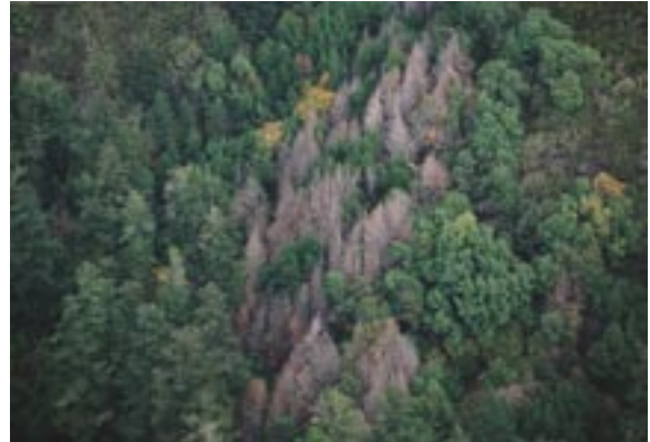
Figure 1. Dead tanoaks in Marin County.