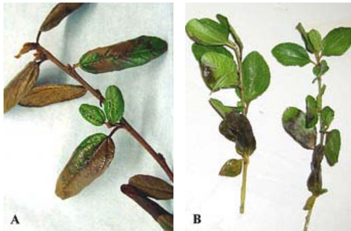
Fig. 3. Phytophthora ramorum blight symptoms on blue blossom, Ceanothus thyrsiflorus , from natural infection (A) and laboratory detached shoot inoculation (B).