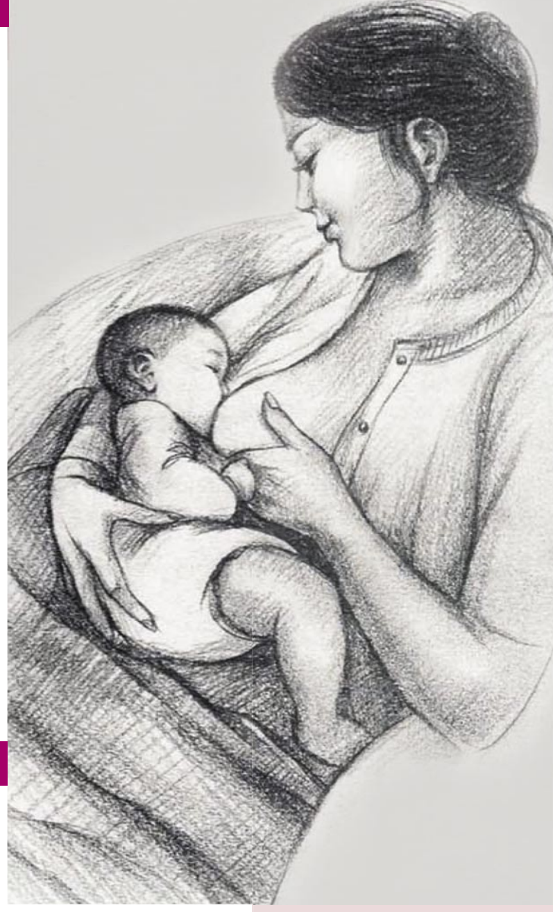
The USDA is an equal opportunity provider and employer.

For additional information, please contact