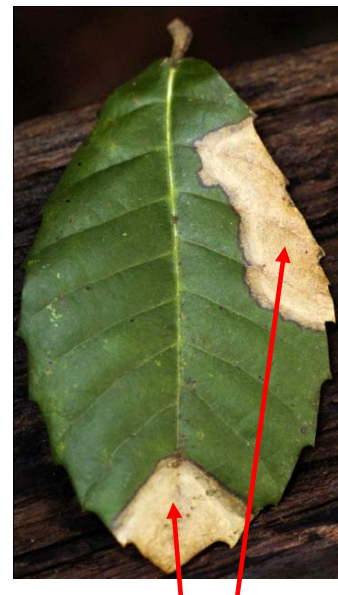
Leaf blotches on tanoak that are not SOD