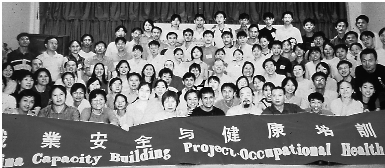
The 90 participants of the course included 15 workers and five supervisors from each of the three footwear factories, 22 representatives from four Hong Kong-based nongovernmental organizations, and eight labor practices staff members from Adidas, Nike, and Reebok.