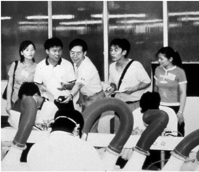
Training participants practice monitoring noise levels in the factory using a sound-level meter.

training. The comparison showed a significant increase in knowledge and problem-solving skills as a result of the training.