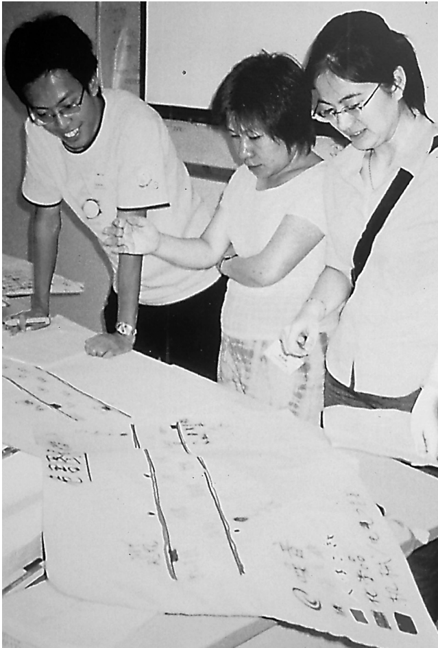
After conducting an inspection of one department in the factory to identify and evaluate hazards, participants draw a visual map of the factory floor using different colors to identify various hazards.

ing of the severity of the hazard and difficulty of correcting it. The inspectors make follow-up visits to ensure that the hazard abatement has occurred, and if it is not corrected after three notices, the safety committee takes the issue to higher managers.