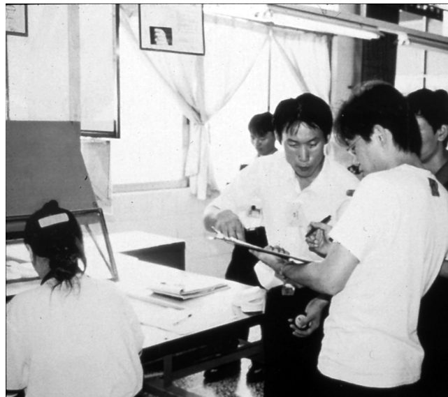
An “inspection team” of training participants takes notes after observing a particular job task and interviewing the workers to learn more about job hazards as part of field exercises in the factory where the training was held.

On the fourth day of the training program, five groups of participants (workers and supervisors from each of the three factories, representatives of the NGOs, and