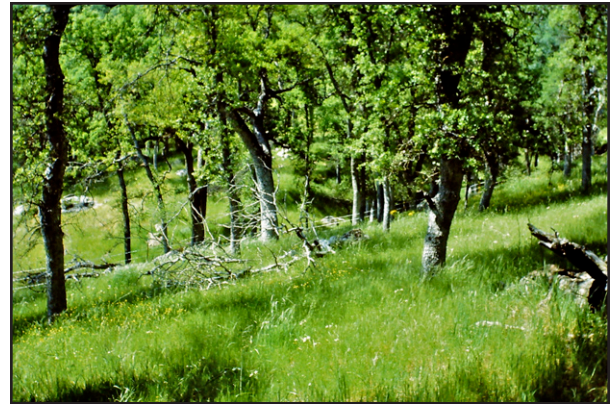
Figure 1. Overview of blue oak woodland study site in Tulare County, California, USA.

Each tree was harvested at a stump height of 0.15 m in 1995. We cut a tree round at the