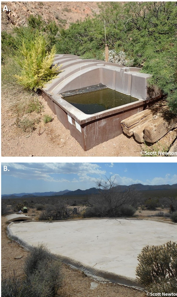
Figure 2. Artificial water catchments (AWC) in the Mojave Desert ecoregion, California, USA, including A) an aboveground AWC that stores rainwater flowing in from deep-sided gullies or rock surfaces, and B) an underground AWC that catches rain from desert pavement and stores it in an underground tank.

following the protocol of Furnas and Callas (2015). The first session was at 30 minutes before sunrise, the second at sunrise, and the third at 30 minutes after sunrise (Furnas and Callas 2015). We had an expert in aural identification of California desert birds review each 5-minute recording and identify bird species by song, call, wing noise, or drumming. To aid in bird identification, the expert examined spectrograms in Raven Pro software (version 1.5; Cornell Lab of Ornithology Bioacoustics Research Program, Ithaca, NY,