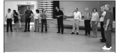
Dinner attendants being trained in Tango dancing.