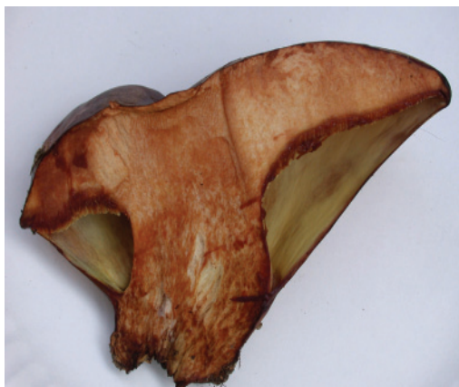
Paragyrodon sphaerosporus from Hillside, CO, preserved in the Denver Botanic Gardens mycological herbarium (photo by John Lennie).

has a limited distribution in the central and more northerly states of the U.S.A., together with a few western outliers. It is not clear from the data available on line and in the literature what factors determine the distribution. The main ones are likely to be climate, soil characters, vegetation, and host presence, with weather as a short-term factor for fruitbody production. Aren't we lucky that mushroom species always seem to have a mystery to lure us on!