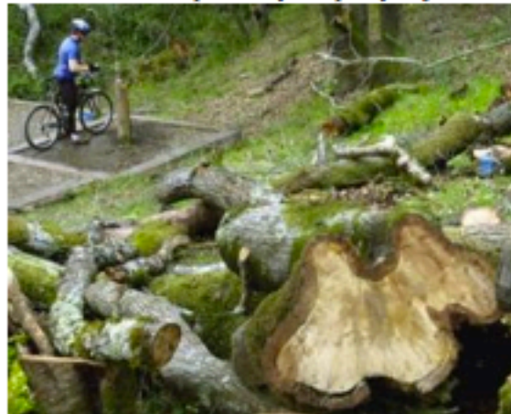
A bicyclist pauses near a hillside covered with the remains of diseased oak trees at the Marin Municipal Water District watershed on the slopes of Mount Tamalpais near Fairfax.

Web-based software called SETILive helps people join the hunt for unusual extraterrestrial signals. The Giant Sunflower Project collects daily bee observations. Another project, Galaxy Zoo, has enabled more than 600,000 amateur astronomers to help classify deep-sky objects.