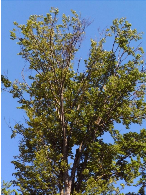
Mature declining beech in Bavaria with high crown transparency, brush- and claw-like leaf clustering, severe losses of lateral twigs, chlorosis and crown dieback due to root and collar rot caused by Phytophthora plurivora .