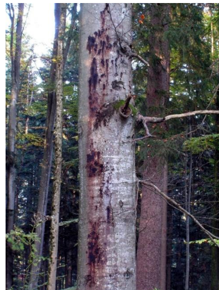
Stem of mature declining beech in a mixed mountain forest with a series of active aerial bleeding cankers caused by Phytophthora plurivora .