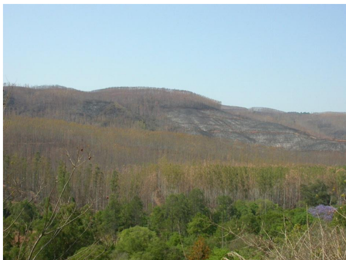
Figure 1. Severe infestation of T. peregrinus in Mpumulanga, South Africa.

This insect is easily dispersed and has spread rapidly between and within countries. It is likely that T. peregrinus will quickly spread to other Eucalyptus growing countries in South America, Africa and the rest of the world. Systemic insecticides have been found to be an effective tool for the control of T. peregrinus , but this approach is generally not feasible for large scale application such as plantations. The parasitic wasp Cleruchoides noackae (Mymaridae: Hymenoptera) has been identified as a potential biological control agent, but its effectiveness to control T. peregrinus must still be determined.