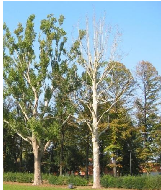
Platanus X acerifolia (London plane) killed by Ceratocystis platani .

Ceratocystis platani is possibly vectored by wood-associated insects and by those visiting fresh wounds on trees. In Greece, spread of the fungus has been found to be associated with ambrosia beetles. In many cases, as reported from Italy, infection is associated with human-caused damage such as pruning wounds or similar injuries. The introduction of C. platani to the southern Mediterranean area is expected to have a dramatic impact on ornamental plantings and boulevards but also on riparian forests of the region. Along stream and river courses where the disease is currently present, stretches of streams of up 100 m have no surviving plane trees. The pathogen, which has been observed on naturalized, P. orientalis along waterways in Sicily, is now also affecting wild P. orientalis along river courses in Greece and appears capable of rapid spread throughout the natural environment.