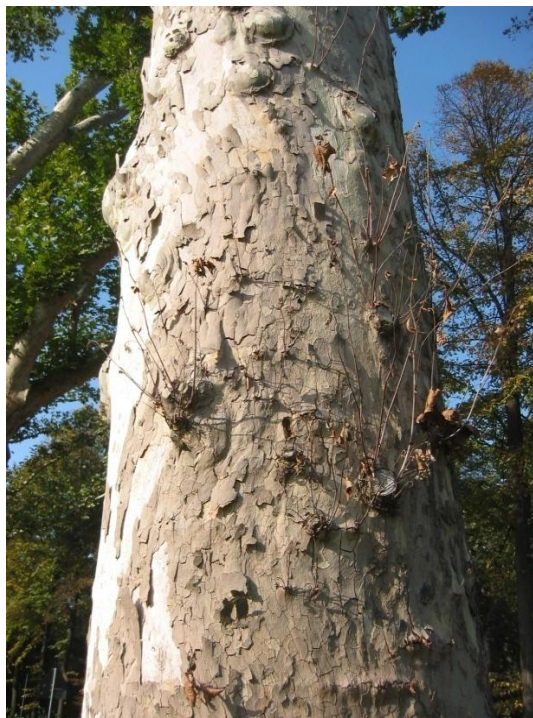
Dead trunk of Platanus X acerifolia