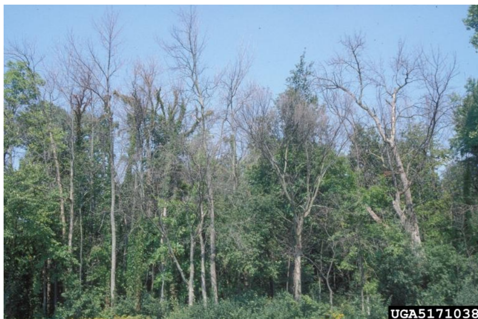
Figure 1. Ash trees in Michigan recently killed by the emerald ash borer.

None of the N. American ash species exhibit any resistance to this insect and it has already caused vast amounts of tree mortality. Much of this mortality has occurred in naturally regenerating forests but extensive mortality has also been in urban areas as well. Many of the cities where mortality is heavy are locations where street trees were killed 30-40 years ago by invading Dutch elm disease and were replanted with ash. Costs associated with removal of dead street trees are typically high and represent a financial hardship for municipal governments. As this species continues to expand its range, these impacts in urban areas will be very large. Impacts in naturally regenerated forests are more poorly understood, but the expected extirpation of ash as a component of these forests may have cascading impacts on associated species.