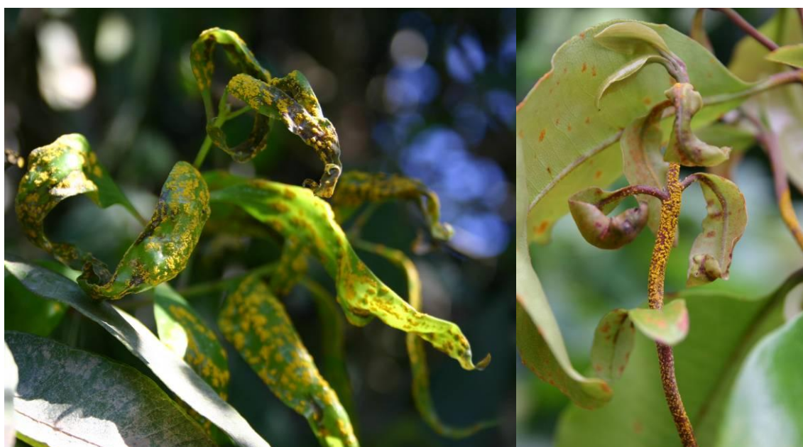
Melaleuca leucadendra and Xanthostemon oppositifolius