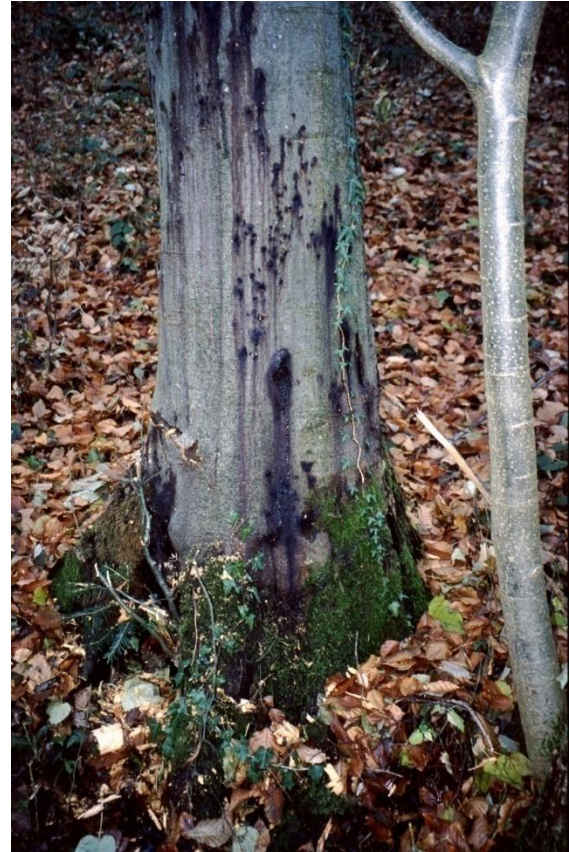
Severe collar rot symptoms caused by Phytophthora cambivora on a mature beech growing in a mixed forest in the Bavarian Alps.