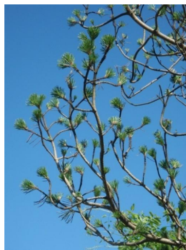
Mycosphaerella dearnessii on Pinus uncinata : Solitary tree with severe infestation in the lower part of the crown in Lower Austria, June 2010.