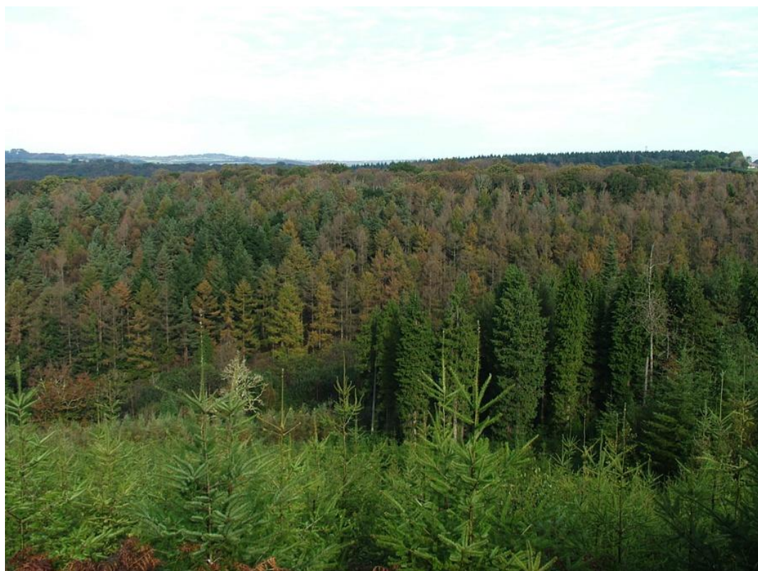
Figure 1. Mortality of Japanese larch in south-west England due to lethal stem infections by Phytophthora ramorum

Phytophthora ramorum is a fungus-like organism first described killing oaks in California, USA; hence it is commonly referred to as ‘sudden oak death’ or SOD (see also on page 9). The geographical origin of P. ramorum is unknown, although thought to be possibly Asia. The pathogen was first reported in the UK in 2002 on a viburnum plant in a garden centre, and until 2009 was found in the UK mainly on ornamental shrubs such as rhododendron, viburnum and camellia. Its introduction into Britain is strongly associated with the international trade in ornamental shrubs. In 2009, P. ramorum was found infecting and killing large numbers of Japanese larch ( Larix kaempferi ) in south-west England (Figure 1), and has since spread to cause large-scale mortality of Japanese larch in Wales and Northern Ireland, with a recent finding in Scotland. Phytophthora ramorum causes lethal stem cankers on Japanese larch and sporulates abundantly on needles, thus aiding aerial spread. This sudden and unexpected change in the pathogen’s behaviour is the first finding, worldwide, of P. ramorum infecting and sporulating on large numbers of a commercially important conifer tree species.