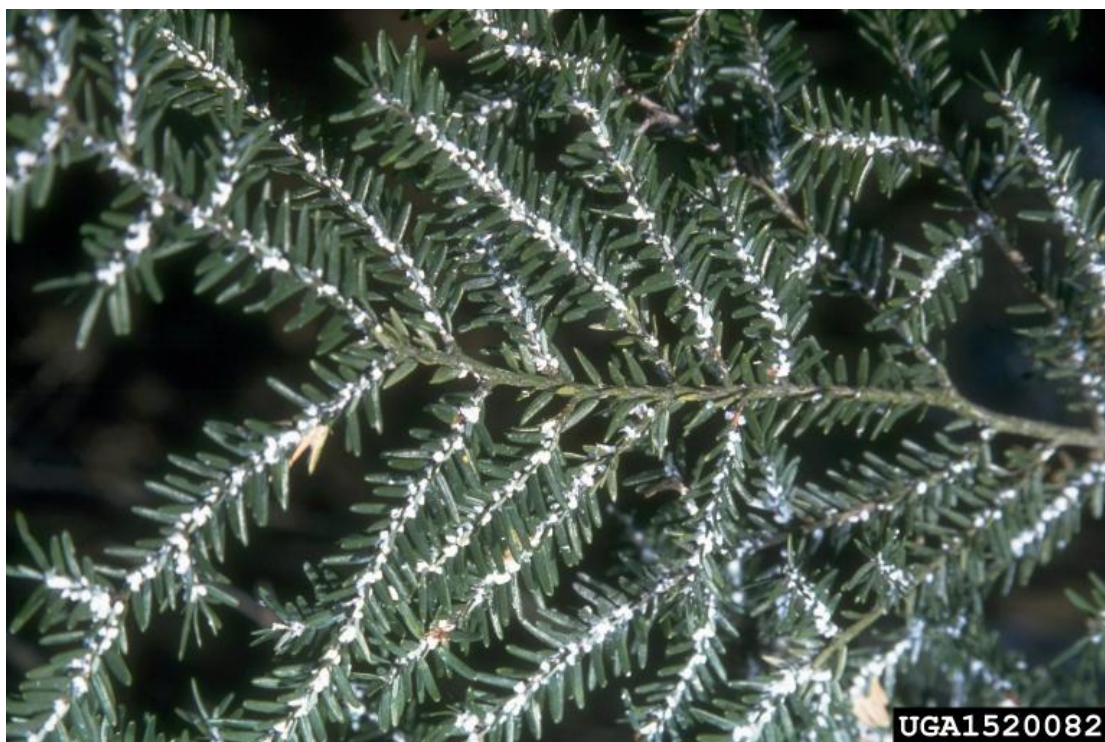
Figure 1. Heavy population of the hemlock woolly adelgid (photo by Daniel Herms, Forestry Images 1523054).

Attempts are being made at biological control of this species via importation of natural enemies however this effort is greatly limited by the fact that no member of the family Adelgidae is known to host any parasitoid species.