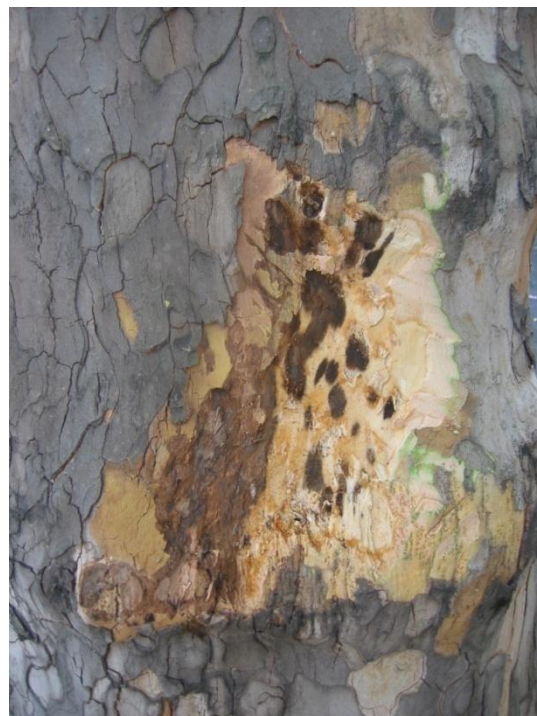
Symptoms of an infection by Ceratocystis platani in the inner bark of Platanus X acerifolia