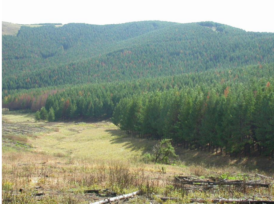
Figure 1. Mortality of Pinus patula in KwaZulu-Natal, South Africa, caused by S. noctilio and its fungal symbiont A. areolatum .

In the non-native plantation environment of the southern hemisphere, S. noctilio has caused severe losses in stands of Pinus species (Figure 1). The pest status of S. noctilio in the USA and Canada, where Pinus species exist in natural forests and plantations and where native siricids and their natural enemies occur, has yet to be determined. Silvicultural practices and biological control have been used to manage populations of S. noctilio . These tactics have shown much success, but the use of silvicultural practices are constrained by economic considerations and success of biological control has not been consistent across different environments.