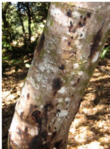
Bleeding tanoak