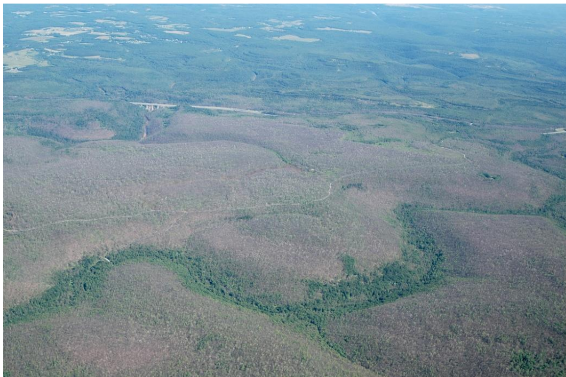
Figure 1. Extensive defoliation of broadleaf forests in Pennsylvania, USA caused by the gypsy moth in 2007 (photo Karl Mierzejewski).

Invading populations established in N. America are believed to have originated from Europe and females from these populations are incapable of flight. Populations originating from various parts of Asia are typically larger and females are capable of flight. Gypsy moth egg masses are often laid on ships, containers, autos and other objects and inadvertently introduced to new areas. There is considerable concern that Asian populations may be inadvertently transported in cargo and invade uninfested portions of the world where they may become serious pests.