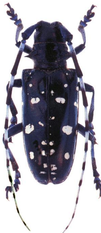
Anoplophora glabripennis

The pest originates from China and has had outbreaks in several European countries: Austria (2001), Germany (2004), Italy (2007), France (2003) and Netherlands (2010). In USA it was first discovered in 1996, and in Canada in 1998. The pest's main pathway to new areas is via solid wood packing material from Asia , but it can also be introduced via plants for planting. The Asian longhorn beetle causes vast damage on urban trees. It has been ranked as a high-risk quarantine pest in Canada, Europe and USA. In China the Asian longhorn beetle has prevented the starting of wood and syrup production from North American maples by repeatedly killing the trees. Its biggest damaging impact in China is on Populus . In USA the pest is estimated to potentially cause in bigger cities an economical damage worth up to $669 billion. APHIS's eradication program estimates the eradication costs in USA to vary from $30 to $48 million a year. The potential economic and ecological impact of the pest is thus high.