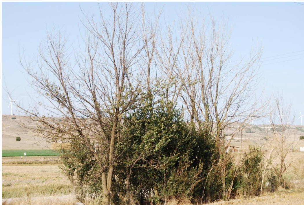
Elm trees killed by Ophiostoma novo-ulmi

The major pathway by which DED has spread globally is through the international trade of timber and untreated logs. Such trade has resulted in the spread of both O. ulmi and O. novo-ulmi to distant geographical parts of continents and their movement across the Atlantic Ocean several times. In nature, these two species of Ophiostoma are vectored by bark beetles of the subfamily Scolytinae . First symptoms of DED include the withering and yellowing of leaves in the upper crowns of infected trees, which progressively spreads to the rest of the tree and results in the dieback of branches. Roots of infected trees ultimately die from starvation because of the loss of nutrients from leaves. Roots that survive infection often produce suckers, which can grow up to five meters in height before getting infected. DED has wiped out most of the mature Elm trees in Europe and North America, except in the northern regions of these continents, where the vector insects generally do not survive the harsh winter conditions.