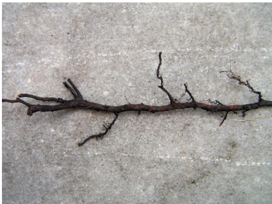
Small woody root (diam 2-5mm) of a declining mature beech with dieback and severe losses of lateral roots and fine roots caused by Phytophthora plurivora and P. cactorum .