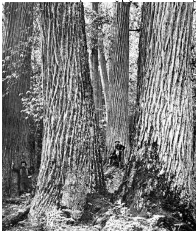
Figure 1. Giant American chestnut trees in North Carolina before the chestnut blight fungus was introduced.

Chestnut blight is caused by the ascomycetous fungus Cryphonectria parasitica . Introduced into North America from Asia in the early 1800s, it is thought that C. parasitica arrived on nursery stock . Chestnut blight was first observed in 1904 on American chestnut trees ( Castanea dentata ) in New York City and within the next three decades it killed most of the mature C. dentata (one source estimates four billion trees!) in the New England and mid Atlantic States of the USA. In Canada, chestnut blight has devastated C. dentata trees in southern Ontario. Cryphonectria parasitica spores are readily spread by wind, rain, and insects and their infection of stems results in lethal cankering. The fungus can also survive as a saprophyte on some oak species, red maple, and shagbark hickory. Ecological impacts of chestnut blight have been significant - American chestnut, once considered the 'Queen' of eastern American forests – has effectively been extirpated and replaced by other hardwood species in these forests. The economic impacts of chestnut blight add up to losses of billion of dollars through the loss of C. dentata as a source of lumber and other forest products, nuts, and tannic acid for tanning leather.