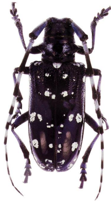
Anoplophora chinensis .

The pest causes devastation on fruit tree farms and especially on citrus plantations and it has been ranked as a high-risk quarantine pest in Canada, Europe and USA. So far its ecological damage on newly introduced areas has been minor. However, it is proposed that it could cause immense economic damage by killing live and healthy amenity trees in urban areas, as well as in natural forests.