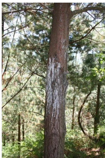
Pitch canker on Pinus nigra ..

In some countries where Pitch Canker has been recently introduced, the persistence of very susceptible species, such as Monterey pine, is endangered. In Spain the presence of F. circinatum in nurseries and plantations has resulted in crop and yield losses, high monitoring and control costs, exportation bans, and a shortage of both Pinus radiata seeds and seedlings in forest nurseries. In addition, the presence of F. circinatum is a potentially serious threat to pine species native to Europe (e.g., Pinus pinaster , P. pinea , P. nigra , P. sylvestris , P. uncinata ); pathogenicity tests suggest that P. halepensis and P. canariensis are very susceptible to the disease. Other decline processes known to be present in Spain in species such as P. pinaster or P. halepensis might further increase the severity of forest damage caused by F. circinatum .