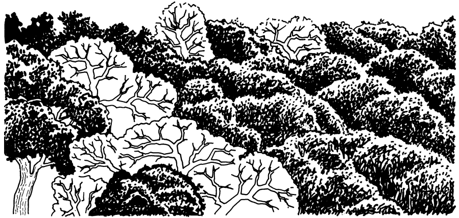
Figure 1. The rapid decline of oak trees in the landscape may signal sudden oak death.

Before the recent discovery of sudden oak death in California, P. ramorum