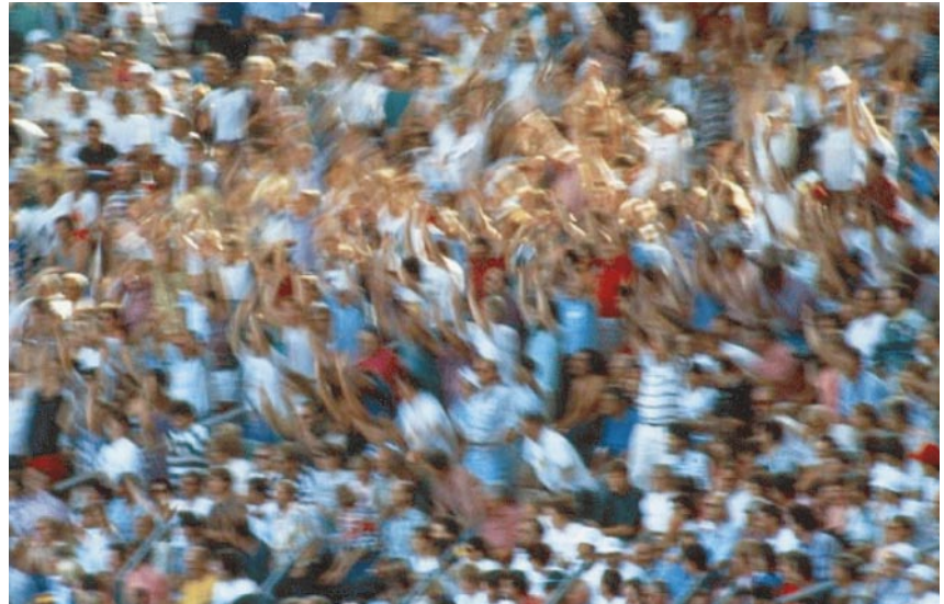
Figure 1 The Mexican wave, or La Ola , sweeping through a crowd of spectators. A few dozen fans leap up with their arms raised and then sit down as people in the next section jump to their feet to repeat and propagate the motion.

Because of the relative simplicity of the Mexican wave, we were able to develop a quantitative treatment of this type of collective behaviour by building and simulating models that accurately reproduce and predict its details. We found that well-established approaches to the theoretical interpretation of excitable media 1–3 , which