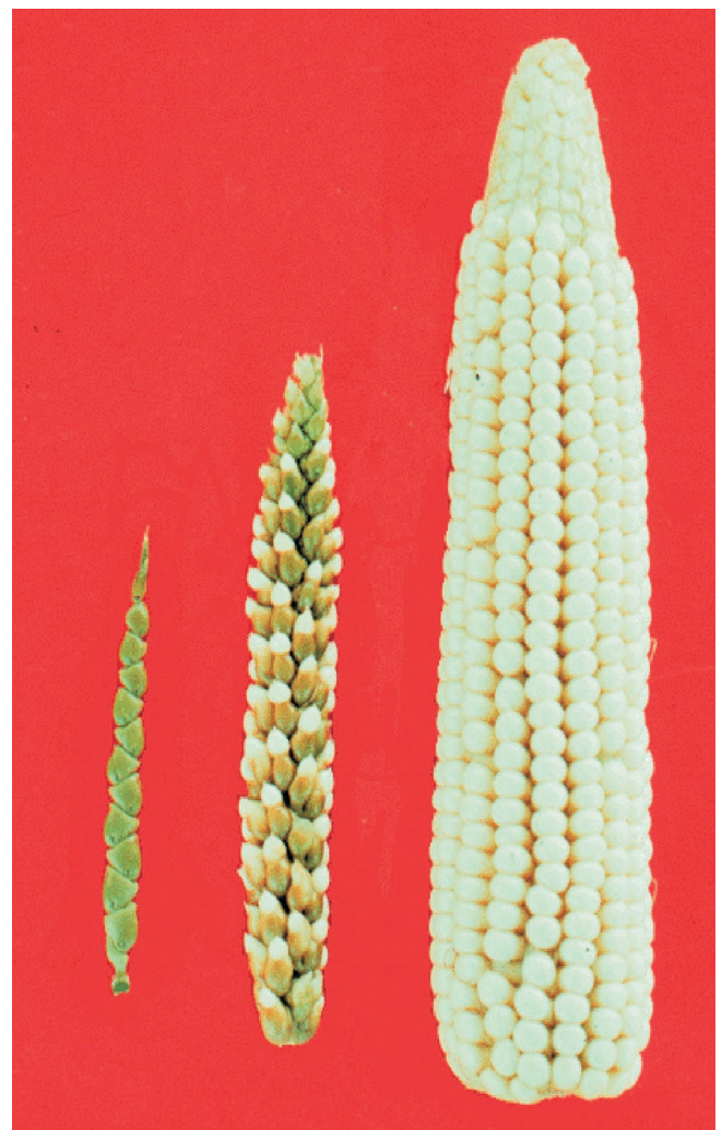
Figure 2. Modern corn hybrid (right), its wild relative teosinte (left), and their hybrid (cob in the center).

To address the concern about long-term health consequences of GM foods, it is instructive to recognize that we worried little about such impacts when massive amounts of new proteins (and unfamiliar chemicals) were introduced into our foods from wild species or when unknown changes were created through mutation breeding. When new foods from exotic crops are introduced, we often assimilate them easily into our diets. What’s more we rarely, if ever, before asked the same questions that we now pose about GM crops. Many so-called functional foods, health foods, and nutraceuticals have been entering into the mainstream American diet lately, with little or no regulation or testing. We do not question the long-term health implications of these food supple-