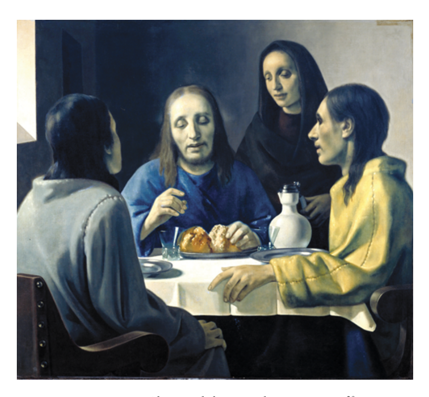
FIGURE 4. Christ and the Disciples at Emmaeus<sup>20</sup>

He then created his first Vermeer forgery, Christ and the Disciples at Emmaeus (fig. 4), which was received and authenticated enthusiastically by Bredius, who wrote in the Burlington Magazine, "It is a wonderful moment in the life of a lover of art when he finds himself suddenly confronted with a hitherto unknown