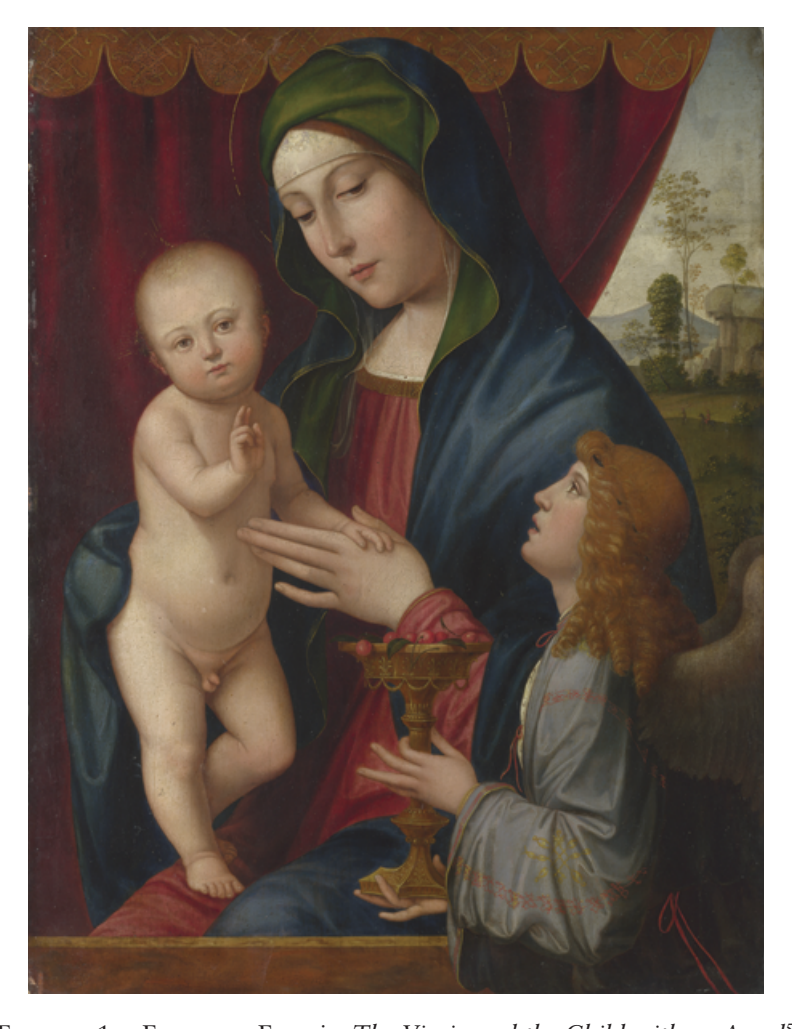
FIGURE 1. Francesco Francia, The Virgin and the Child with an Angel<sup>5</sup>

inconsistent with Renaissance paintings,<sup>4</sup> suggesting that the 1924 version might be a forgery.