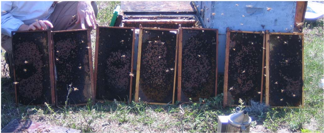
Figure 1. Frames of brood with insufficient bee coverage, indicating the rapid loss of adult bees. doi:10.1371/journal.pone.0006481.g001

etiology of disease [7] as defined in the broadest sense - a departure from perfect health [8]. Descriptive epizootiological studies attempt to elucidate the cause(s) of disease by comparing health and risk factors in “diseased” and “non-diseased” populations [8]. A hallmark of these studies is that they are performed without a specific hypothesis, but they require an ability to classify the surveyed population into “diseased” and “non-diseased” individuals (in this case, colonies) based on a case definition.