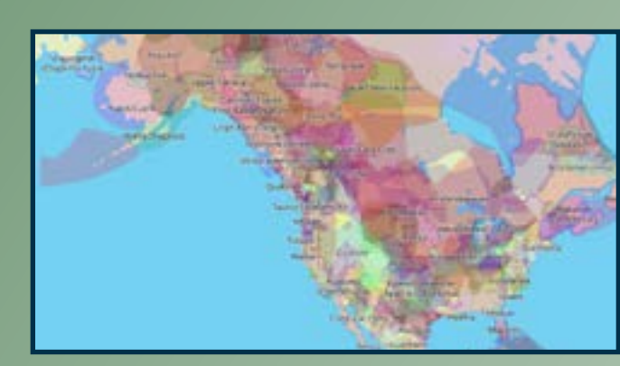
Locate which indigenous lands you live on