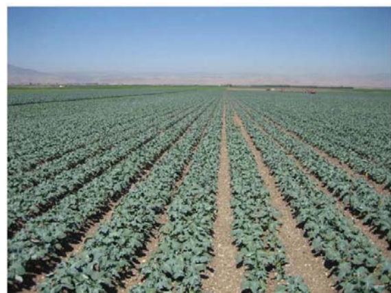
Fig. 2. Organic broccoli production as a monoculture in the Salinas Valley, California. Unlike a diversified farming system (whether certified as organic or not), this organic production system is more like conventional industrialized agriculture, utilizing substantial off-farm inputs such as purchased compost and other soil amendments, “organic” pesticides, etc.

DFS is similar to another concept, ecoagriculture, in recognizing that landscapes, not single farms, are important targets of land management. Other concepts, such as climate-smart agricultural landscapes or integrated watershed management, also make this link ( http://blog.ecoagriculture.org/2012/03/05/terminology/ , accessed Mar 13 2012), each with their own particular emphasis. DFS emphasizes how farming practices operating from plot to landscape scales maintain functional biodiversity and thus ecosystem services. Ecoagriculture emphasizes “landscapes in which biodiversity conservation is an explicit objective of agriculture” (Scherr and McNeely 2008:477). The DFS concept highlights the critical reciprocity underlying the ecoagriculture concept, that is, that the ecoagricultural landscape promotes biodiversity and in turn, critical components of biodiversity (i.e., functional biodiversity) promote agriculture through provision of ecosystem services. In summary, DFS, while closely allied to all of these concepts, places more emphasis upon the relationship between functional biodiversity and ecosystem services.