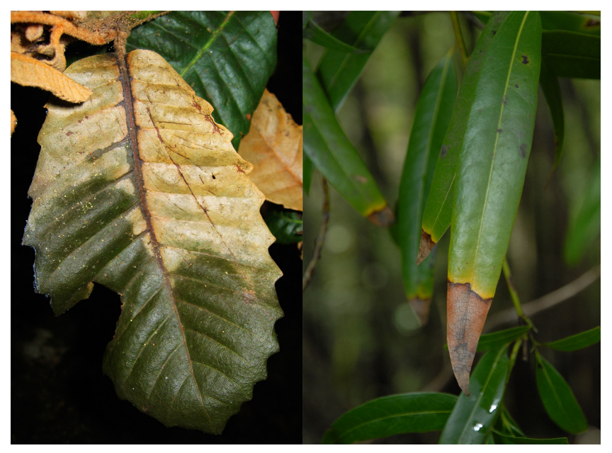
FIG 2 Foliar lesions caused by Phytophthora ramorum colonizing a tanoak leaf through the petiole and following the midvein (left), and causing lesions on a bay laurel where a film of water accumulates for several hours after rain events (right).