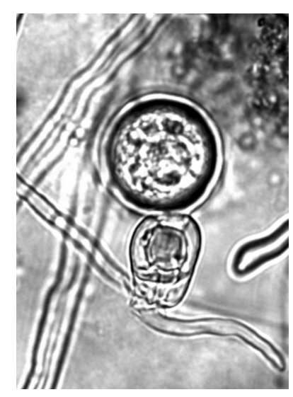
FIG 1 A viable, thick-walled oospore of Phytophthora ramorum produced by crossing an NA1 with an EU1 genotype.

P. ramorum is in the so-called clade 8 of the genus Phytophthora and is a close relative of P. lateralis, P. hibernalis, and P. foliorum (73). The origin of P. ramorum is still unknown, but the recent discovery in Taiwan of P. lateralis (7), a species also presumed to be exotic and present in California and Oregon, suggests that this group of phytophthoras may have an eastern Asian origin. P.