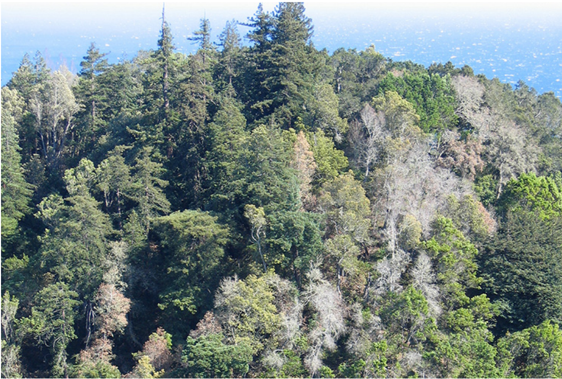
Sudden Oak Death is causing extensive tanoak and oak mortality in the Big Sur region.