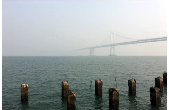
Detoxify? Drink ginger? What to do after 10 days of bad air