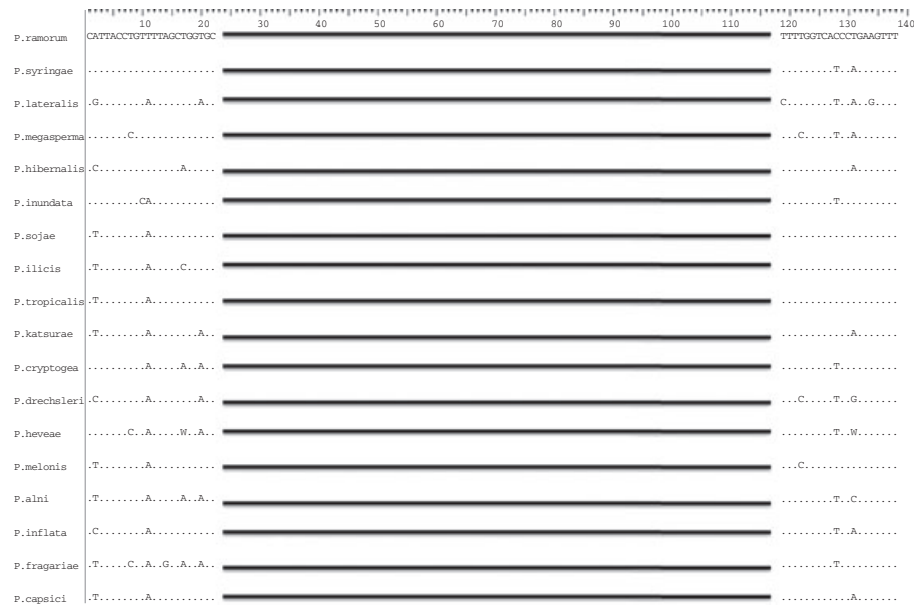
Fig. 1. Multiple sequence alignment of selected primers utilized in COX I PCR of 18 different Phytophthora species. PCR primer sequences are shown in the first line. Colours underscore the homologous deletion breakpoint region whereas letters show the position of discrepancy between sequences from GenBank.