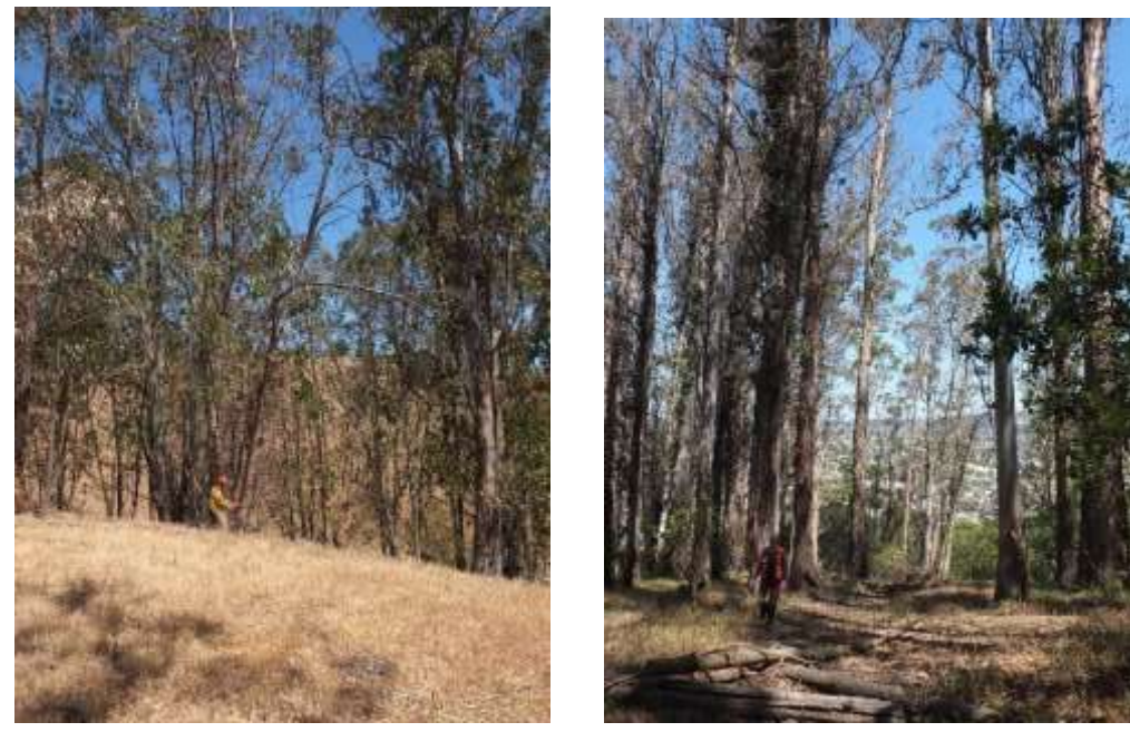
Figure 1. Examples of dieback in eucalyptus.

At each site we sampled from four trees with dieback symptoms. We rated trees based on foliage browning/spotting levels, using a scale of 0-5; 0 being unaffected and 5 being dead. All the collections were from trees rated 2-4 (Fig. 1). For each tree we took samples - if lesions or staining were present - in the roots, root collar, stem, branches, twigs, and leaves (Fig. 2). In addition, we collected soil at the root collar to test for the presence of soilborne pathogens, including Phytophthoras. Trees were felled to enable access to the branches and leaves and to assess the condition of the entire bole (Fig. 3).