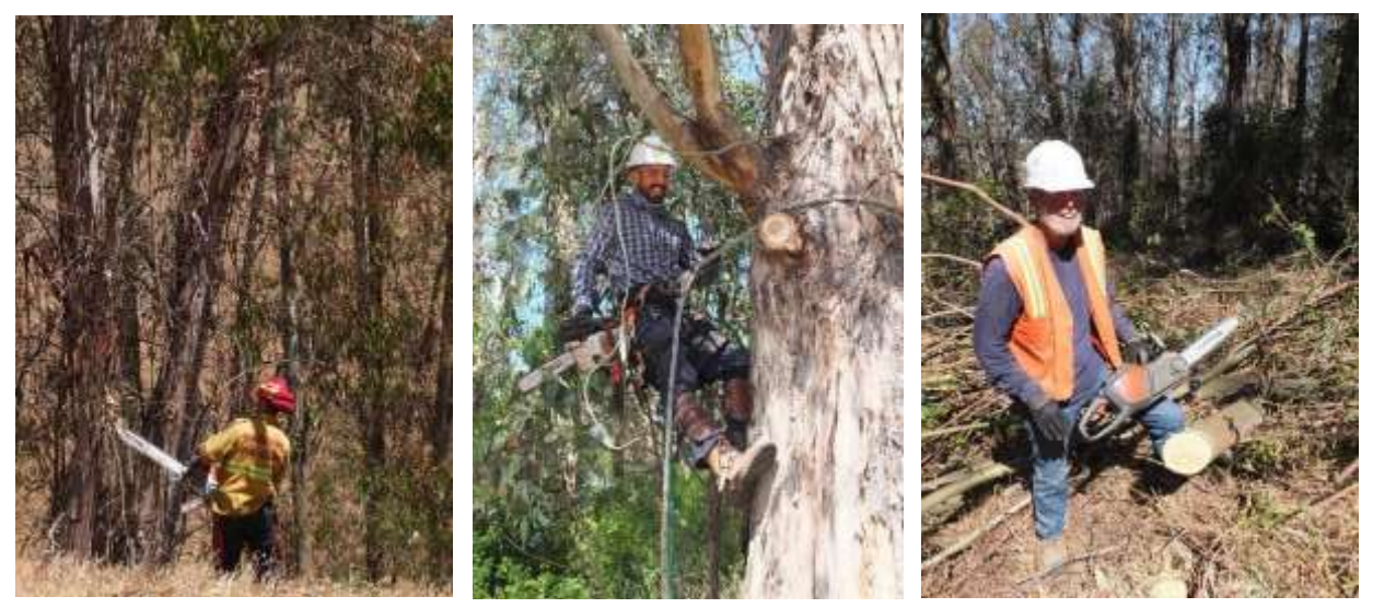
Figure 3. Tree fallers at Tilden regional park, SFPUC and Albany Hill.

Isolations were made from all collected material on a variety of media: MEA, PARPH, Fusarium select, Leptographium select. We also placed a piece of plant tissue between two slices of fresh carrot (a method for retrieving Ceratocystis spp.) and incubated in the dark. For the stem and branch samples we plated from both bleached (30 s in 5% sodium hypochlorite followed by rinsing in sterile distilled water) and unbleached (sterile distilled water only) pieces. Soil samples were collected to be tested for presence of Phytophthora using a soil baiting method. Soil was first dried for ten days, re-wetted and placed at 5 <sup>o</sup>C in the dark for three days. Samples were brought to room temperature and more water was added to about twice the volume of the soil. A green organic pear, organic oregano and a rhododendron leaf were floated in the container and checked for lesions after three, seven and ten days. Lesion segments, if any, were plated onto PARPH media.