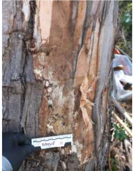
Figure 6. Phanerochaete martelliana mycelial mat (white).