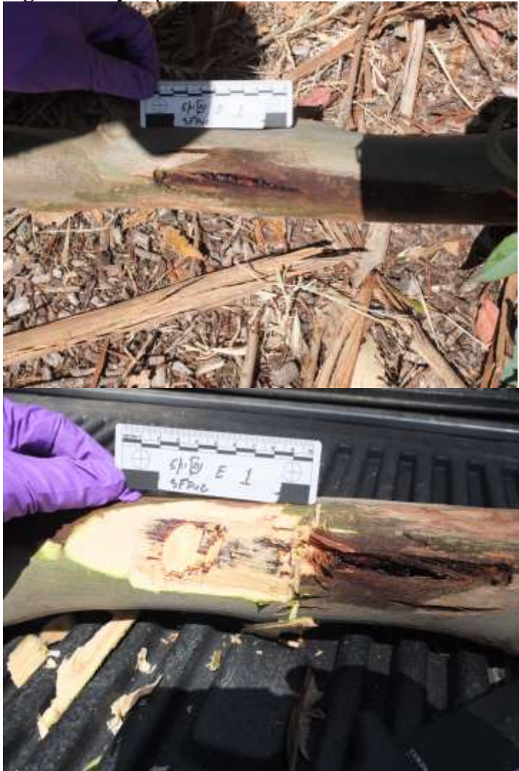
Figure 5. Cytospora canker.

The Botryosphaeriaceous (Bot) fungus Neofusicoccum eucalyptorum was isolated from three of four sites sampled in the East San Francisco Bay, twice from a twig and once from a branch. Branch and twigs displayed typical underbark lesions/cankers. This fungus has not been officially reported in California (4), and as most Bot fungi, it has a latent phase and canker development is associated with environmental stressors (7). Although mostly isolated from Euycalyptus, this fungus is known to have a rather broad host range, including multiple myrtaceous and ericaceous hosts, especially where Eucalyptus is grown outside of its native range (8, 9). The only other Bot fungus isolated was Diplodia sapinea from the stem of a single tree: incidence and severity of stem Diplodia cankers are known to be correlated with drought and other environmental stresses (10).