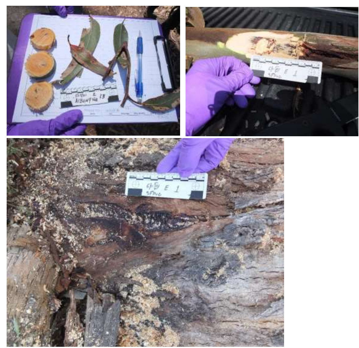
Figure 2. Examples of collected material.