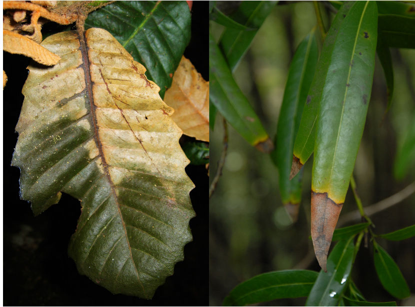
FIG 2 Foliar lesions caused by Phytophthora ramorum colonizing a tanoak leaf through the petiole and following the midvein (left), and causing lesions on a bay laurel where a film of water accumulates for several hours after rain events (right).