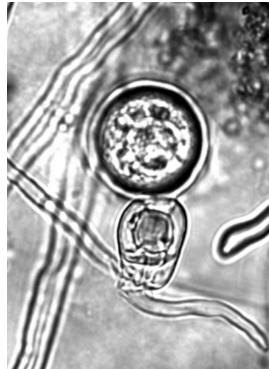
FIG 1 A viable, thick-walled oospore of Phytophthora ramorum produced by crossing an NA1 with an EU1 genotype.

P. ramorum is in the so-called clade 8 of the genus Phytophthora and is a close relative of P. lateralis , P. hibernalis , and P. foliorum (73). The origin of P. ramorum is still unknown, but the recent discovery in Taiwan of P. lateralis (7), a species also presumed to be exotic and present in California and Oregon, suggests that this group of phytophthoras may have an eastern Asian origin. P.