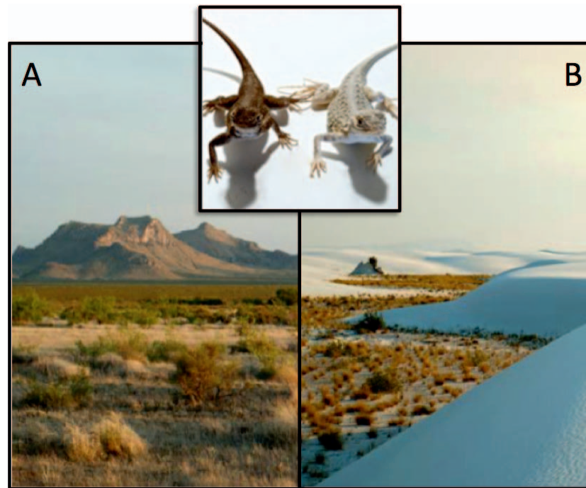
FIG. 1. Contrasting habitats occupied by different H. maculata ecomorphs: (A) dark soil and (B) White Sands.

pus, is an important neuroanatomical structure for navigation (Hoogland and Vermeulen-Van der Zee, 1987; Day et al. 2001). The positive relationship, in which there is a greater cell expanse in the medial cortex of species that inhabit more spatially complex and demanding habitats, has been reported in other lizards (Powell and Leal, 2012), birds (Roth et al., 2012), bats (Safi and Dechmann, 2005), fish (Shumway, 2008), and humans (Maguire et al., 2000). Because of the dramatic differences in the habitats inhabited by Lesser Earless Lizards, we hypothesized that there would be differences in the size of the medial cortex in the White Sands and dark soil ecomorphs. The White Sands habitat has less vegetation, reduced species richness, and abundance of competitors and predators (Des Roches et al., 2011; Rosenblum and Harmon, 2011). For example, White Sands contains about half of the amount of yucca trees and shrubs as compared to the surrounding Chihuahuan desert, and three species of lizards as compared to 35 species of reptiles in the