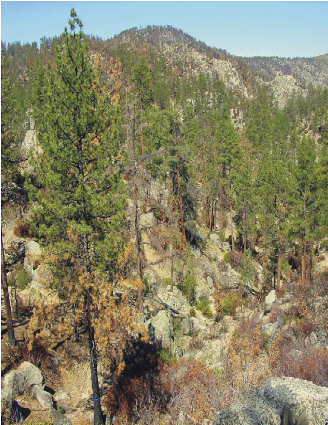
Fig. 1. This photo of an unmanaged Jeffrey pine-mixed conifer forest was taken 3 yr after a 2003 wildfire in northern Sierra San Pedro Martir (SSPM), northwestern Mexico, the first fire in this area in several decades. Observations of average forest stand characteristics, i.e., tree and snag density, basal area, fuel loads, are uncommon in these forests. This spatial heterogeneity is due to recurring disturbances such as fire, which influence landscape patterns.