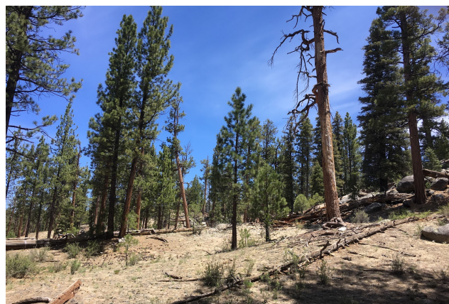
Figure 1: Jeffrey pine stand in the SSPM.