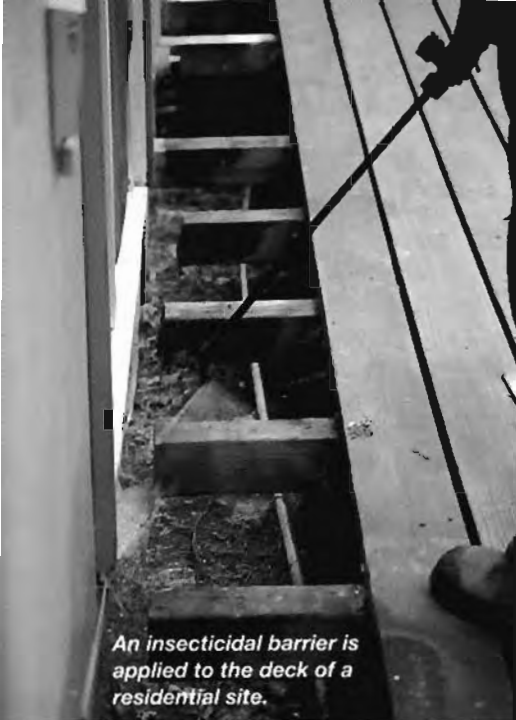
An insecticidal barrier is applied to the deck of a residential site.

mately 38 feet per gallon. Gallons of dilute material varied among buildings (Tables one and two). The chemical barrier was applied around the perimeter of the structure, one foot up the exterior wall and two feet out from the foundation. Exterior decking was sprayed, as well as any landscape shrubbery within the two-foot band extending from the foundation.