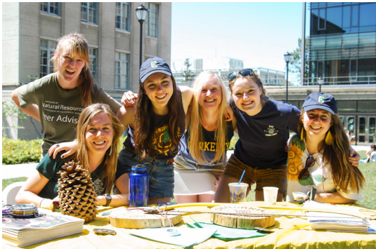
Table at Information Marketplace 9 a.m. - 4 p.m., Sproul Plaza

Featuring College of Natural Resources staff and peer advisors. Located in Dwinelle Plaza, next to Sather Gate and Wheeler Hall, the Marketplace is a central area featuring displays and information. Stop by the College of Natural Resources (CNR) table to pick up information about the college and have your questions answered!