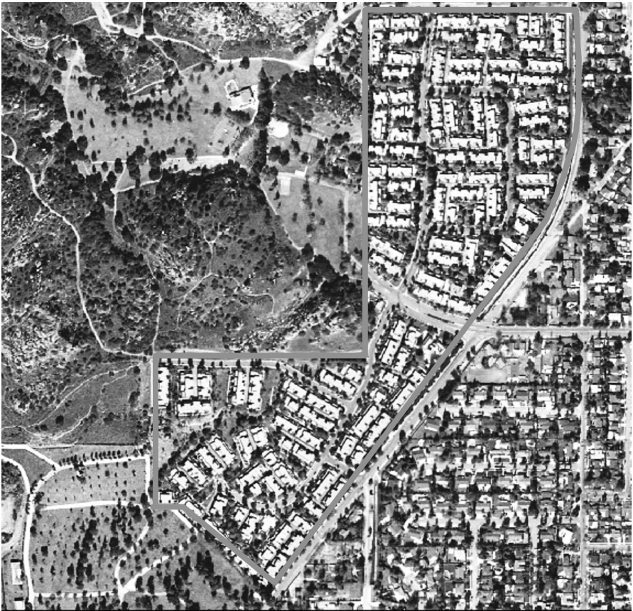
Fig.1. Aerial view of the RockPointe Condominium Complex, Chatsworth, CA. The condominium complex is outlined with a solid gray line.

A pest management firm installed Sentricon ® stations around 134 of the 139 buildings from October through December 2001. Initially, 7,327 Sentricon ® stations were installed, with an average of ca. 54 stations per building. All Sentricon ® stations were inspected monthly throughout the study. This monthly monitoring was the responsibility of one technician.